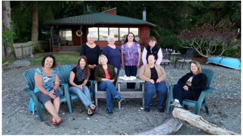
The group's last evening on Bainbridge Island during a special visit with author Susan Wiggs.

Find out more about ImagineIF at www.imagineiflibraries.org .