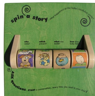
Spinning stories interactive panel.