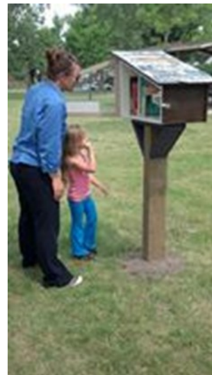
Community members checking out one of the Little Free Libraries.